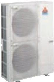
Outdoor unit PUY-A42NHA3