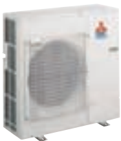
Outdoor unit PUY-A24/30/36NHA3