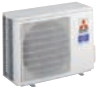
Outdoor unit PUY-A12/18NHA3