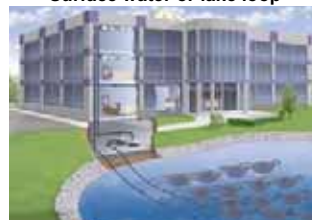
Surface water or lake loop

A "Surface Water" or "Lake" closed loop system is a geothermal loop that is directly installed in a lake or body of water that is near the building. In many cases, the body of water is constructed on the building site to meet drainage or aesthetic requirements. The size and the depth of the lake is critical and commercial design services should be used that certify a given body of water is sufficient to withstand the building loads.