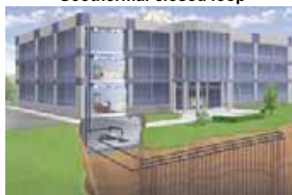
Geothermal closed loop

Vertical Loops (shown) are installed by drilling vertical bore holes into the earth and inserting a plastic polyethylene supply/return pipe into the holes. Horizontal loops are installed in trenches approximately 5 feet below the ground surface. Both vertical and horizontal loops extract the Earth's natural heat and reject it back.