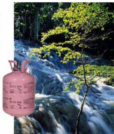
R-410A refrigerant (Models CCH/CCW) with no ozone depletion potential