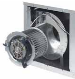
Removable orifice ring