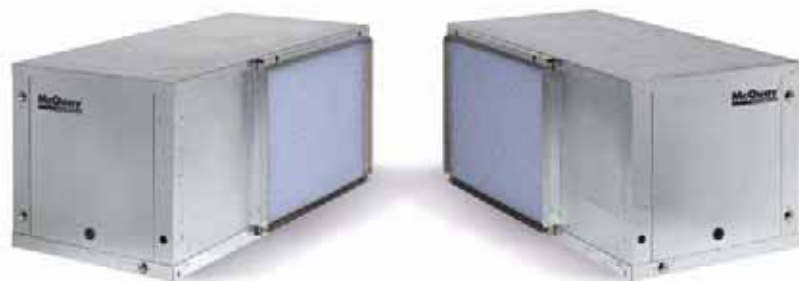
R-22 Models CRH/CRW (1/2 to 6 tons)

For the most current information, refer to www.mcquay.com .