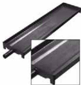
Plastic, double-sloped drain pan