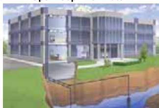
Open loop "well water"

"Open Loop" well water systems use ground water to remove or add heat to the interior water loop. The key benefit of an open loop system is the constant water temperature, usually 50°F to 60°F, which provides efficient operation at a low first cost. Open Loop applications are commonly used in coastal areas where soil characteristics allow reinjection wells to return the water back to the aquifer. Reinjection wells must be approved by the U.S. Environmental Protection Agency.