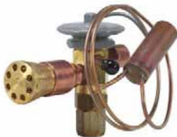
Thermal expansion valve (standard and geothermal models)